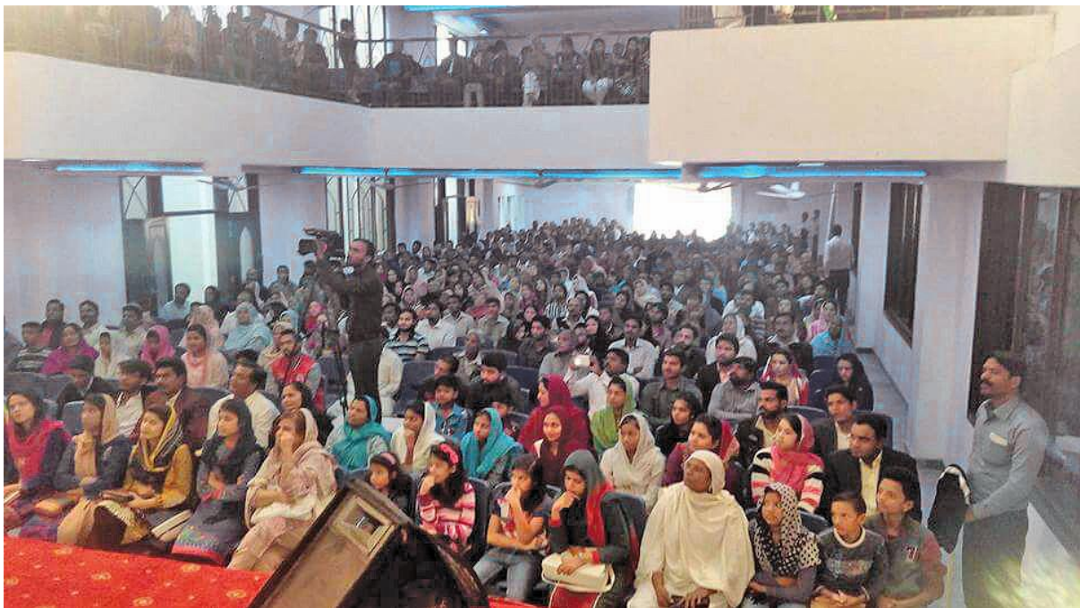
Figure 1 Iyi foto irekana amateraniro ya kabiri yabereye mu itorero rimwe i Lahore, Pakisitani