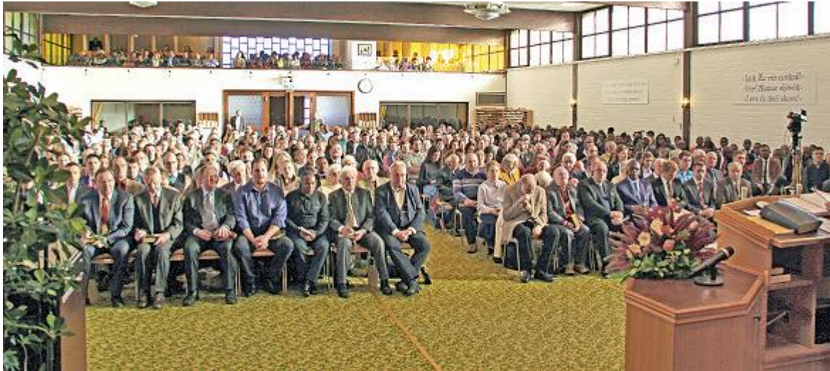
Figure 2. Amateraniri yabereye mu kigo cy'ivugabutumwa i Kirefelidi, tariki 4/12/2016

Mwami mukundwa, wibuke isezerano wagiranye natwe, n'amaraso wanennye ku bwacu, n'amasezerano waduhaye, kandi ku bw'ubuntu bwawe, uhe abaragwa bawe ubugingo bwawe buhoraho.